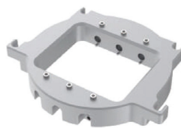
CAD Block Holder

* Products are subject to change without notice to improve quality, function, design, or otherwise.