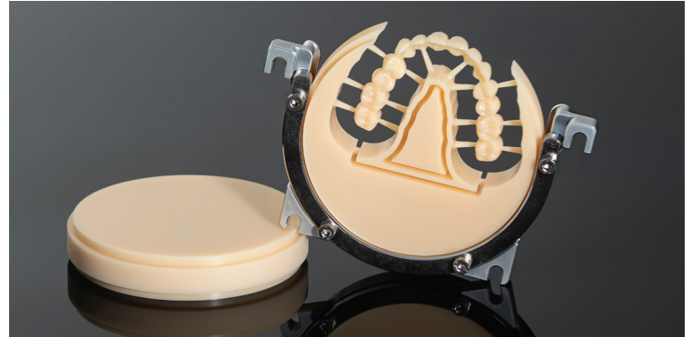
Efficient C-Clamp (included with mill)

Precision milling of facial-side, and buccal-side textures, as well as under-cut areas for minimized post-processing time.