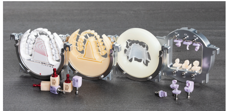
Quickly Switch Between Fixtures & Materials

Precision milling of facial-side, and buccal-side textures, as well as under-cut areas for minimized post-processing time.